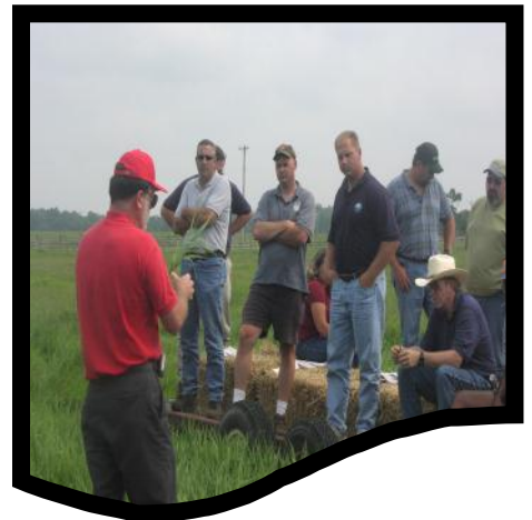
Above: Attendees at a Pasture walk at UM Wye Angus Farm.