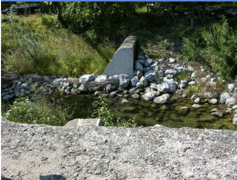
A dam notch, part of the Lopatcong Creek restoration project.

More photos can be found at www.sjred.org/ma/confphotos/