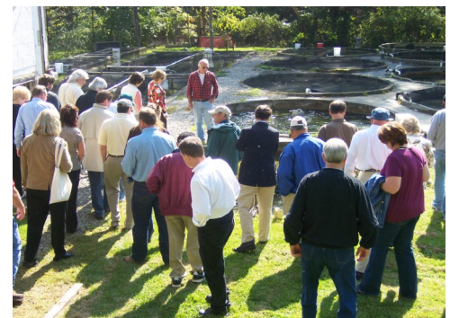
RC&D Board Members from all over the country visiting a successful RC&D project in New Jersey.