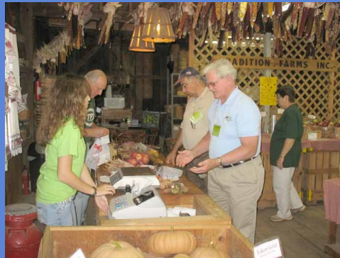
Conference attendees visiting the Traditions Farm, part of the "River-Friendly Farm" program