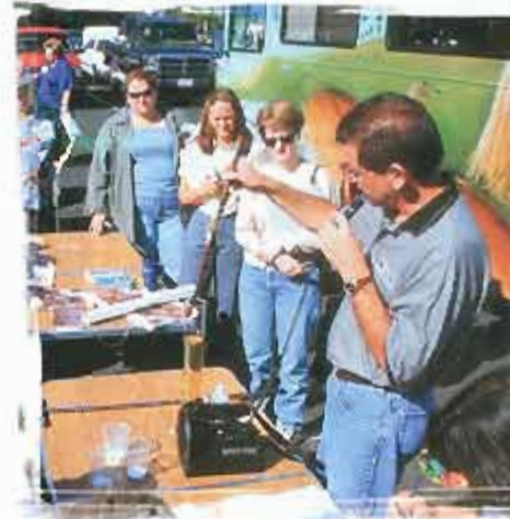
Conservation on Wheels —A bus was converted into a mobile conservation education classroom and is used for teacher demonstrations and youth education. A project of: South Coast RC&D, Riverside, California