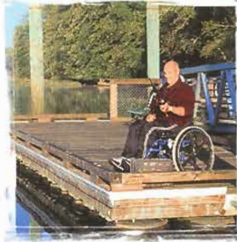
Wheelchair-Accessible Lake —“Friend’s Landing” is a wheelchair-accessible lake with fishing docks that is used for recreation, conservation education, and tours. A project of: Columbia-Pacific RC&D, Aberdeen, Washington

www.nrcs.usda.gov/programs/red/index.html