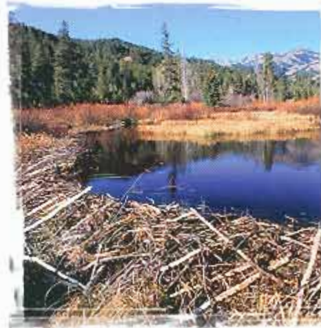
Wetland/Pond Filtration Project —Water management projects, such as a canal diversion or a series of wetlands and ponds, are vital for filtering contaminants before they enter local streams. A project of: Wood River RC&D, Gooding, Idaho